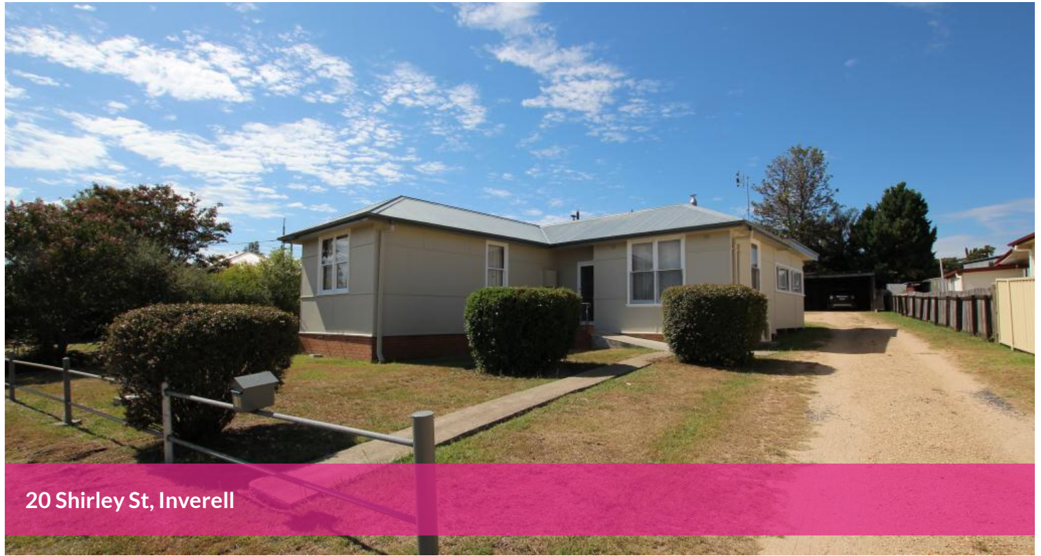
20 Shirley St, Inverell