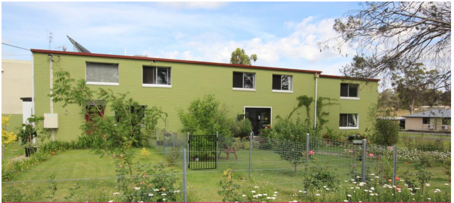
6B Brewery St, Inverell