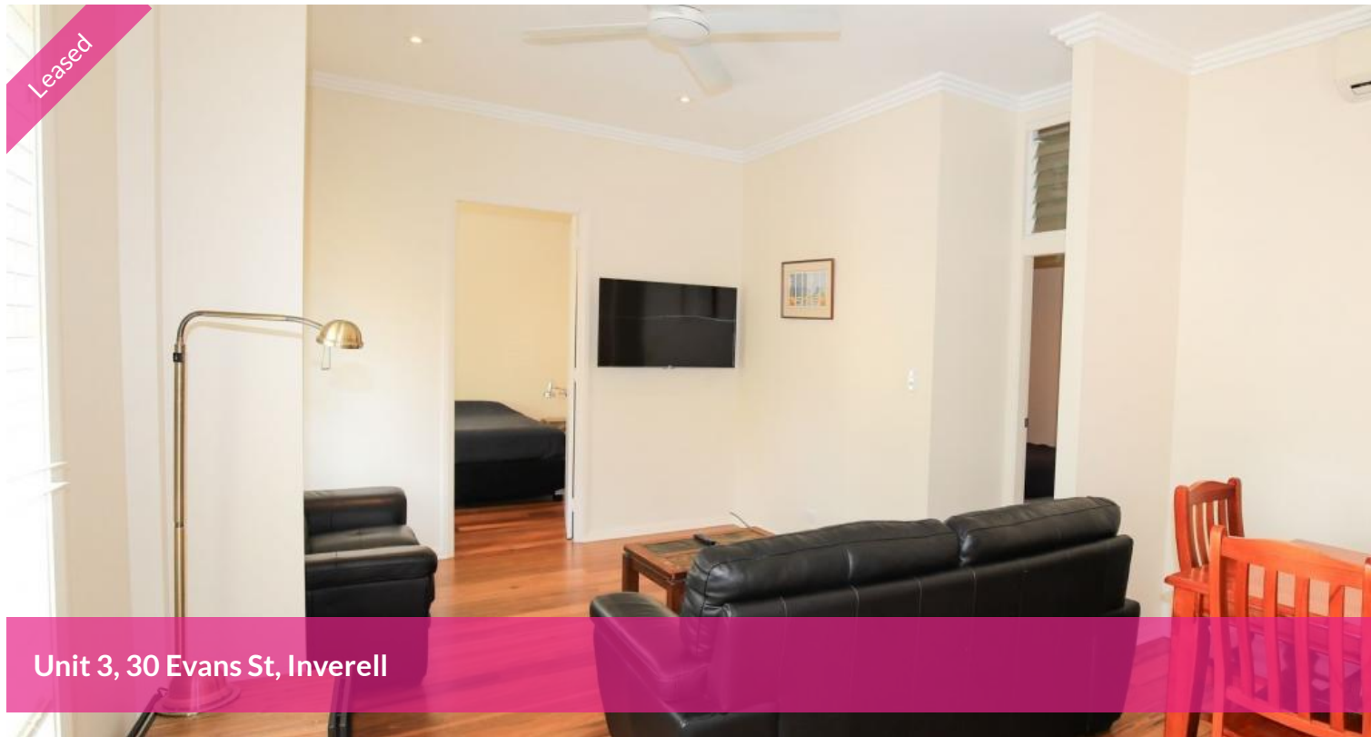
Unit 3, 30 Evans St, Inverell